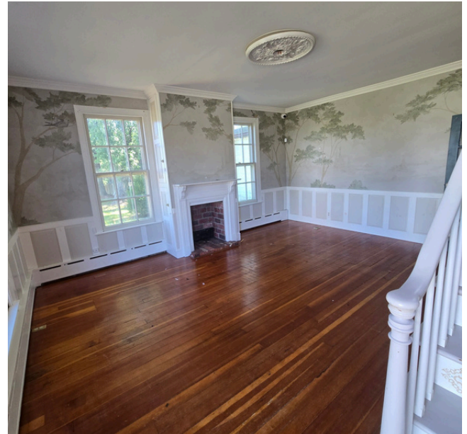
Living Room in Main House