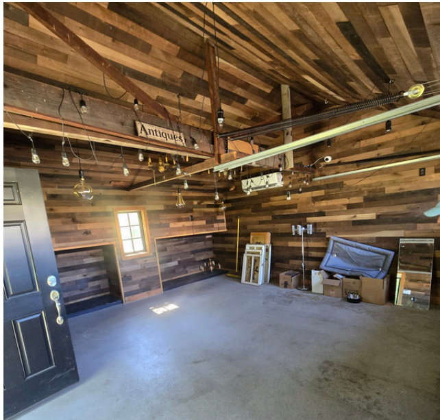
Main Floor in Barn